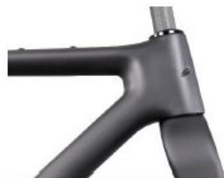
Tapered 1-1/2" ,1-1/2"

T: +31 6 21358547 E: info@14carbon.com W: www.14carbon.com