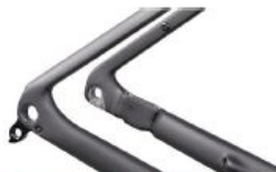
Thru axle 142*12mm