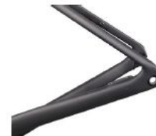
Disc—flat mount 140mm