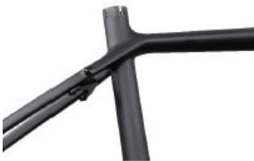
Concealed seat clamp